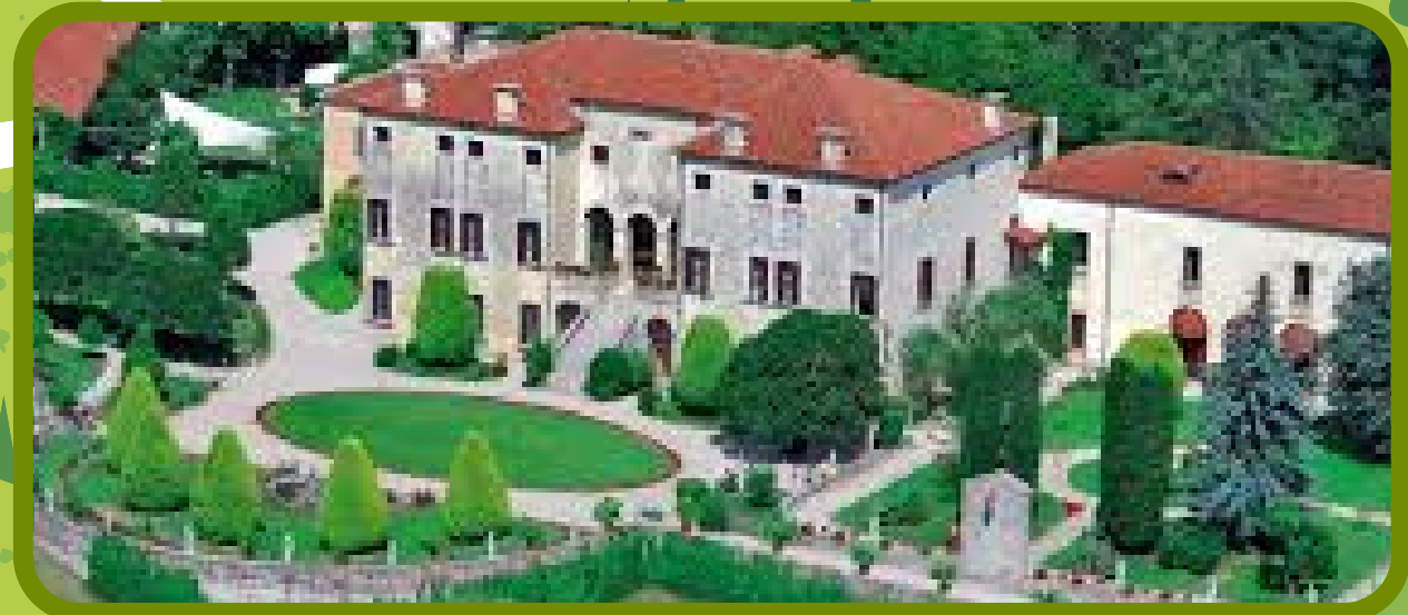
15 minutes on foot